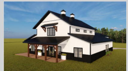
Upgraded model shown