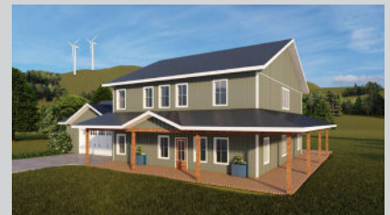
Upgraded model shown