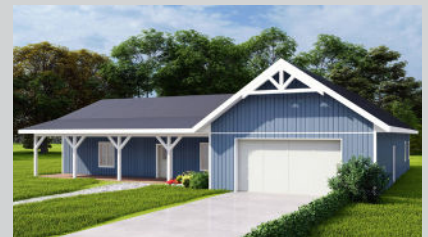
Upgraded model shown