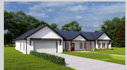
Upgraded model shown