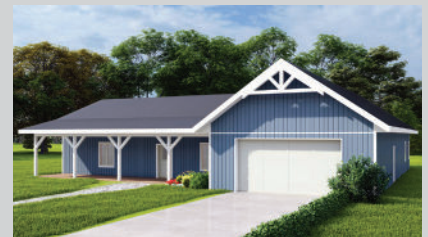
Upgraded model shown