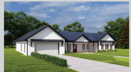
Upgraded model shown